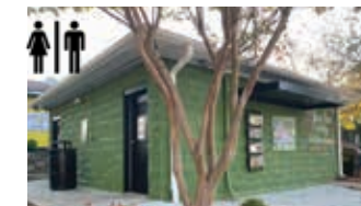
LOCATED ON COMMERCIAL STREET ADJACENT TO THE BOTANICAL GARDEN