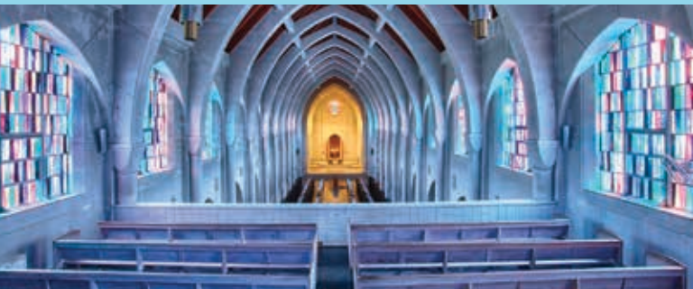
"GEORGIA'S MOST REMARKABLE CONCRETE BUILDING," ~ GEORGIA CONTRACTOR MAGAZINE