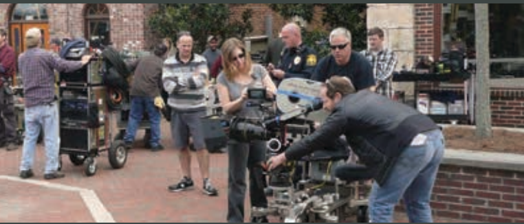
FILMING THE ORIGINALS IN OLDE TOWN CONYERS

What's filming around town? Among the many movies and television shows filmed in Conyers in recent years, here are a few noteworthy mentions: