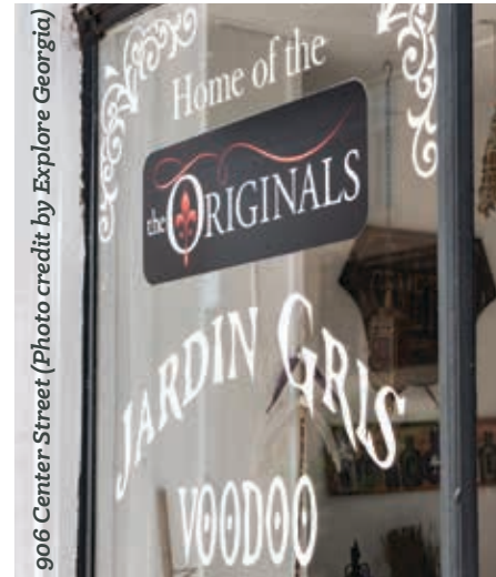
906 Center Street

For a more complete list of filming in Conyers, scan the QR code below: