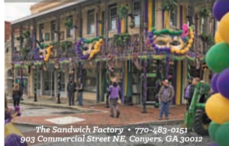
The Sandwich Factory • 770-483-0151 903 Commercial Street NE, Conyers, GA 30012