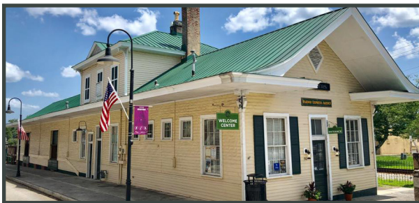
CONYERS WELCOME CENTER 901 Railroad Street, Conyers GA 30012 770-602-2606 • 1-800-CONYERS

All information used in this self-guided tour was provided by www.IMDb.com