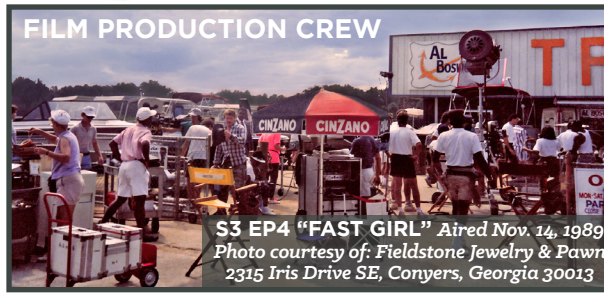
FILM PRODUCTION CREW S3 EP4 "FAST GIRL" Aired Nov. 14, 1989