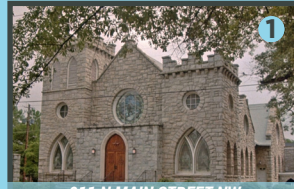
911 N MAIN STREET NW

S4 EP9 "A PROBLEM TOO PERSONAL" Aired Nov. 20, 1990 Olde Town Conyers Downtown Historic District, Conyers, Georgia 30012