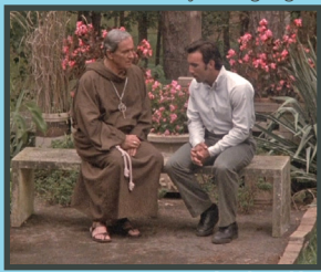
2,300+ acres open year-round to the public. Monk-made items available for purchase at the Abbey gift store. A self-guided Monastic Heritage center, Monk collection of Bonsai on display, prayer walk, retreat house, lake and picnic. Check website for current hours.