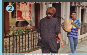
902 CENTER STREET