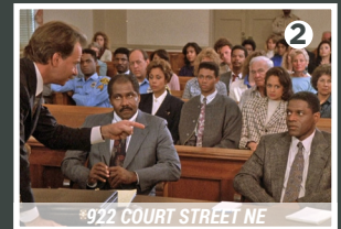
*922 COURT STREET NE

Film Location #1 - Rockdale County High School: Opening scene of Harriet's son Gene running high school track where he is having difficulty deciding if he wants to continue during family issues.