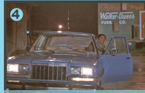
901 RAILROAD STREET

Film Location #1 - Conyers Presbyterian: Opening scene of church exterior, Chief Gillespie attends a sermon, afterwards he briefly speaks to the new pastor at front door, and then leaves to cross the street.