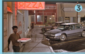
907 COMMERCIAL STREET NE