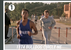
1174 BULLDOG CIRCLE NE

A follow-up to A Problem Too Personal (1990), Harriet's ex-husband Vic Glennon is tried for felony murder, although he did not fire his weapon or harm anyone. Harriet must decide how much public support to show for Vic and how to deal with their son Gene.